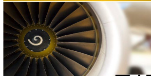
An AESQ Reference Manual Supporting SAE AS13100-1 Standard